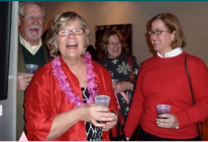
Laughs all around at last year's Visionary Valentine event. This year's event is Feb. 12.