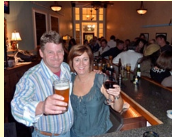
Leaky Pete's opened in November.

Fond farewells to Gigi's Trattoria, Scoop Station, Pear Tree South, Trumpeter Swan Antiques, Colortyme, and Maris Elaine Gallery.