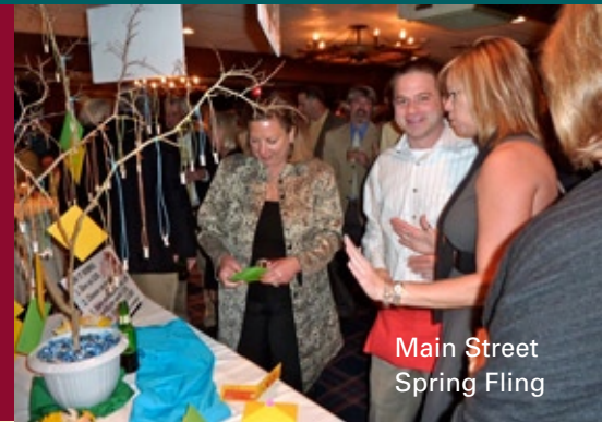
Main Street Spring Fling