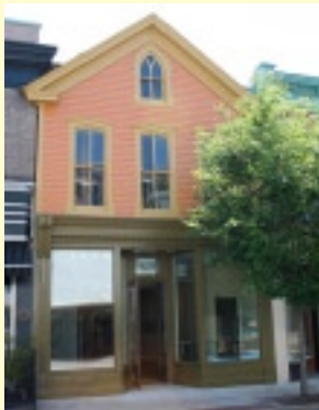
Tubman Museum's new look

New stylists and services at Mirror Mirror Salon